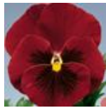
Delta Pure Red