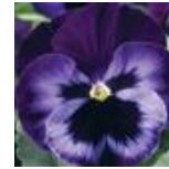
Delta Neon Violet