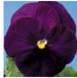
Delta Pure Violet