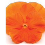
Matrix Orange Clear