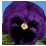
Delta Blue w/Blotch

Here are some of the Pansy/Viola varieties we currently have.