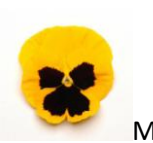
Matrix Yellow w/Blotch