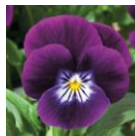
Penny Violet Flare