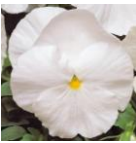
Matrix White Clear