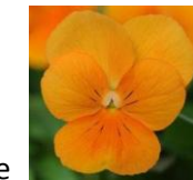
Viola Penny Orange