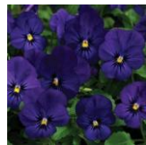
Viola Penny deep blue