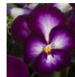
Ultima Radiance Violet