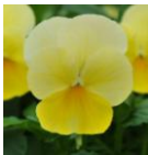
Sorbet Lemon Chiffon